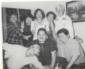
Teamwork is the Key to Accomplishment!