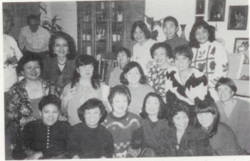
Every person or member of the club is very important. The members are the lifeblood of the club.